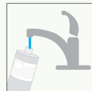
Sample Bottle 2