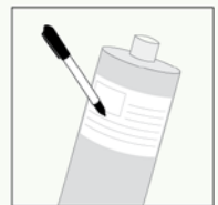
Sample Bottle 1